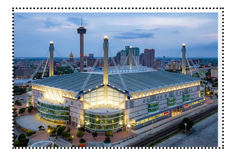
Stadium - The Alamodome Hosted the Final.

The Alamodome Stadium in Texas, hosted the NCAA Men's basketball final. The Final took place on April 7th, 2025. The Florida Gators won the 2024 NCAA Men's Division with a score of 65-63.